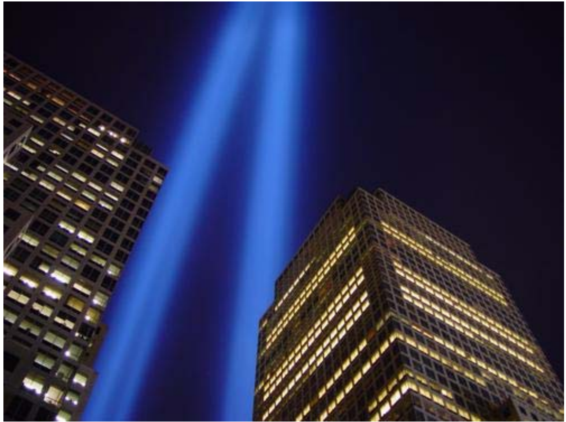
September 11 "Tribute in Light" Memorial

...America is not a place, but an idea, made real every day by those who believe in it.