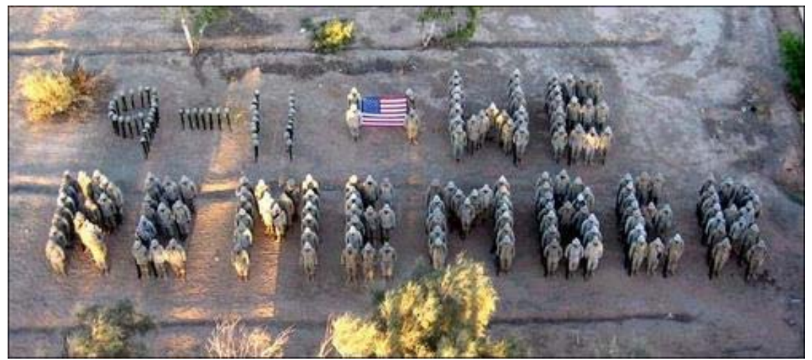
United States Marine Corps Baker Company