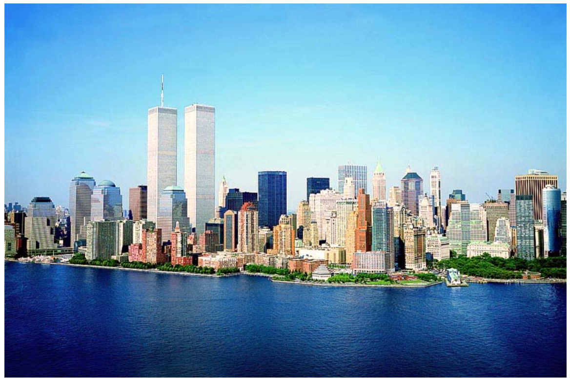
New York City, August 2001