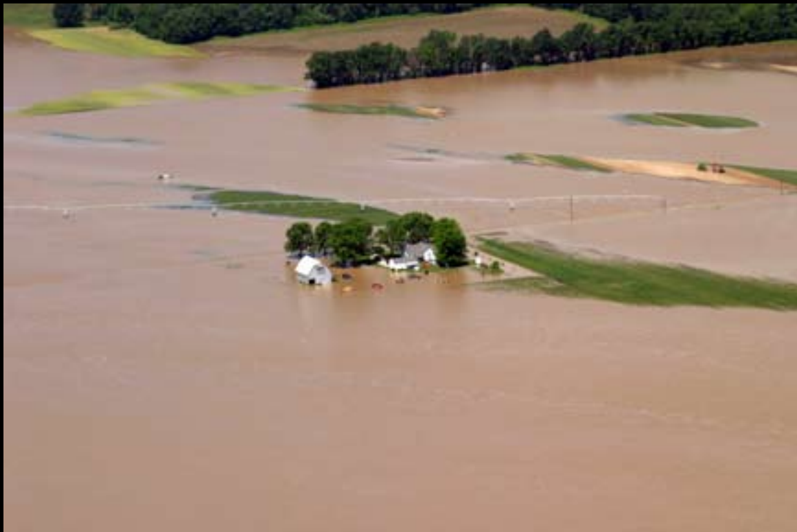
IMG_9285 Flood of 2008