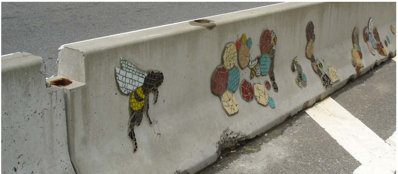
Tillary Street between Cadman Plaza West and Adams Street (Spring 2009) Downtown Brooklyn Partnership and Groundswell Community Mural Project