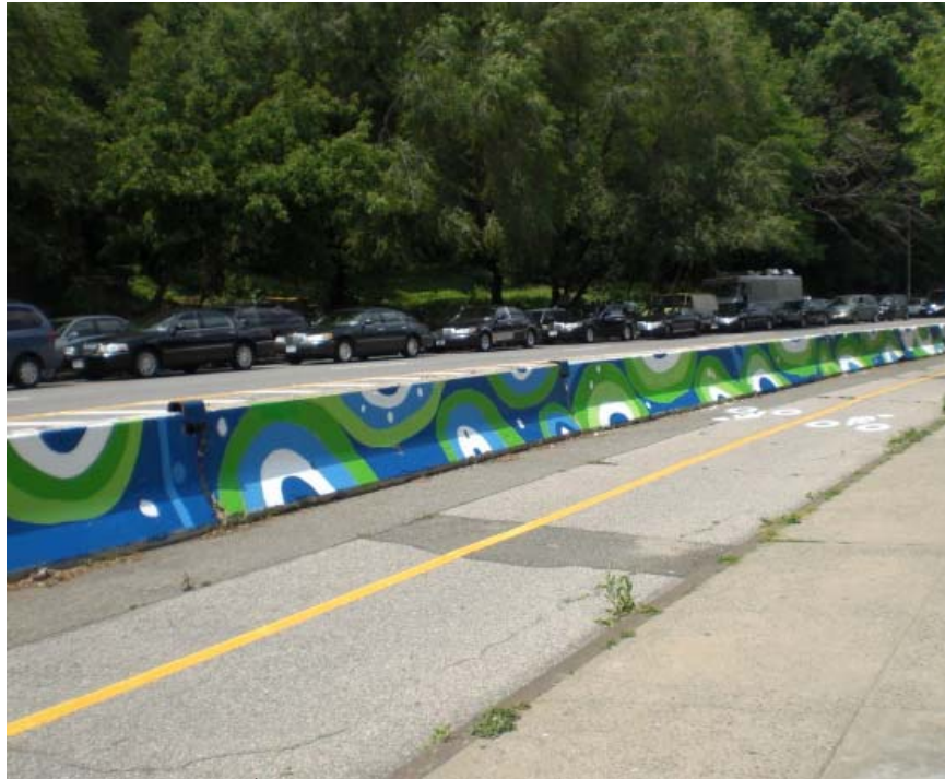
155 th Street along FDR Drive (Spring 2008) City Year and Grey Worldwide