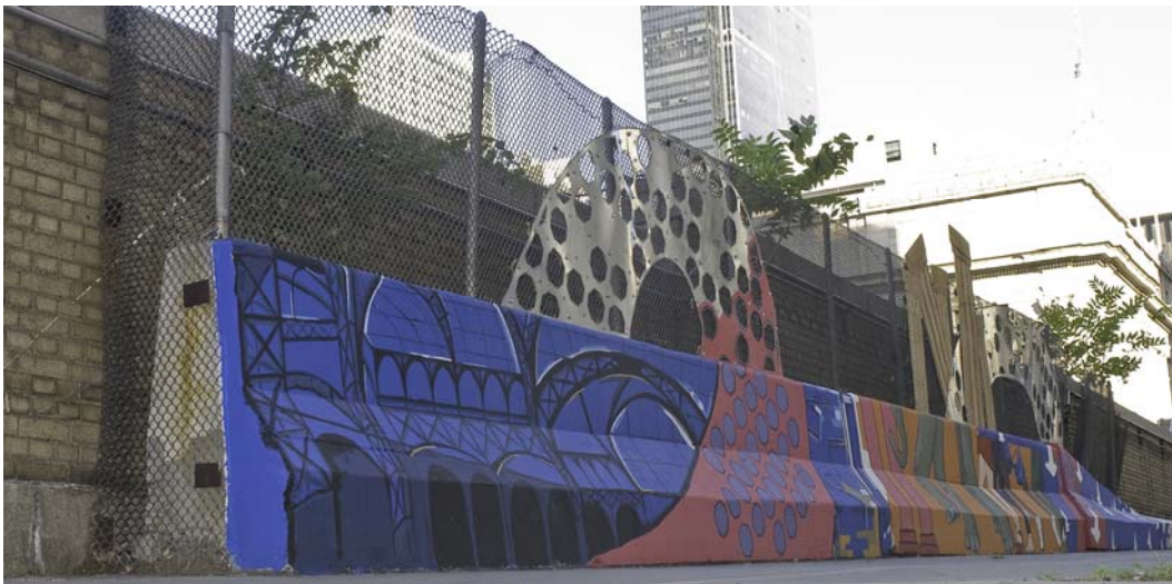
31 st Street between 9 th and Dyer Avenues (Summer 2008) 34 th Street Partnership and Fashion Institute of Technology (Urban Studios Club)